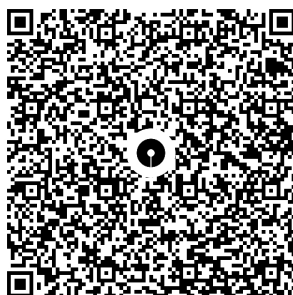
Figure 1: QR code to pay application fee

In both of the above methods, verify the account holder's name : MAHATMA GANDHI GOVT ARTS COLLEGE